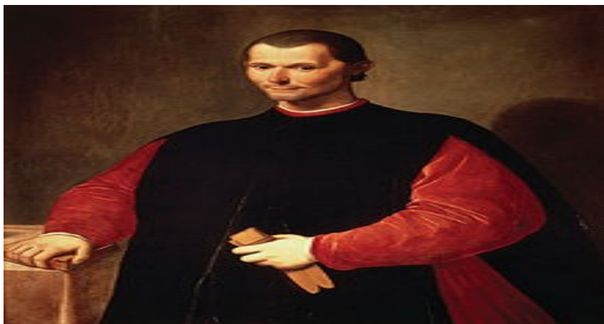
Figure 1.1 Portrait of Niccolò Machiavelli by Santi di Tito

Niccollo De Bernardo De Machiavelli's biography is well précised by (Machiavelli, 2014) according to bibliography website he was born on May 3, 1469, in Florence, Italy, Niccolò Machiavelli was a diplomat for 14 years in Italy's Florentine Republic during the Medici family's exile. When the Medici family returned to power in 1512, Machiavelli was dismissed and briefly jailed. He then wrote The Prince , a handbook for politicians on the use of ruthless, self-serving cunning, inspiring the term "Machiavellian" and establishing Machiavelli as the "father of modern political theory." He also wrote several poems and plays. He died on June 21, 1527, in Florence, Italy