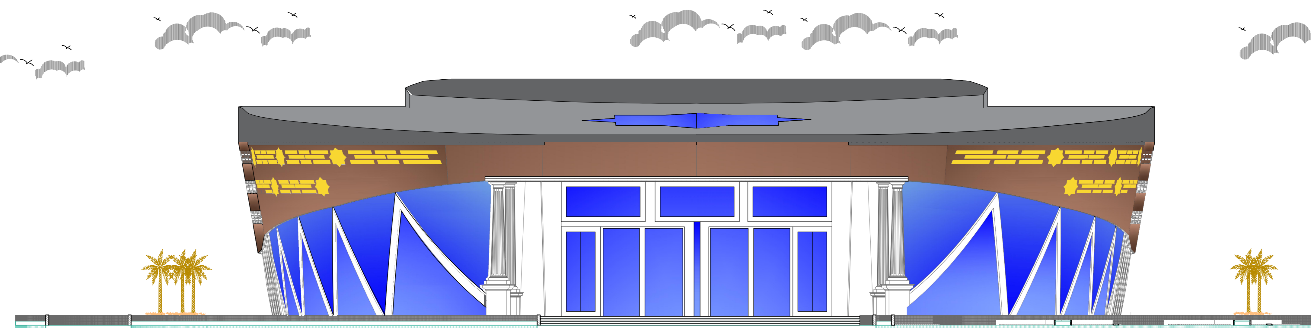
FACADE PRINCIPALE ECH: 1/200