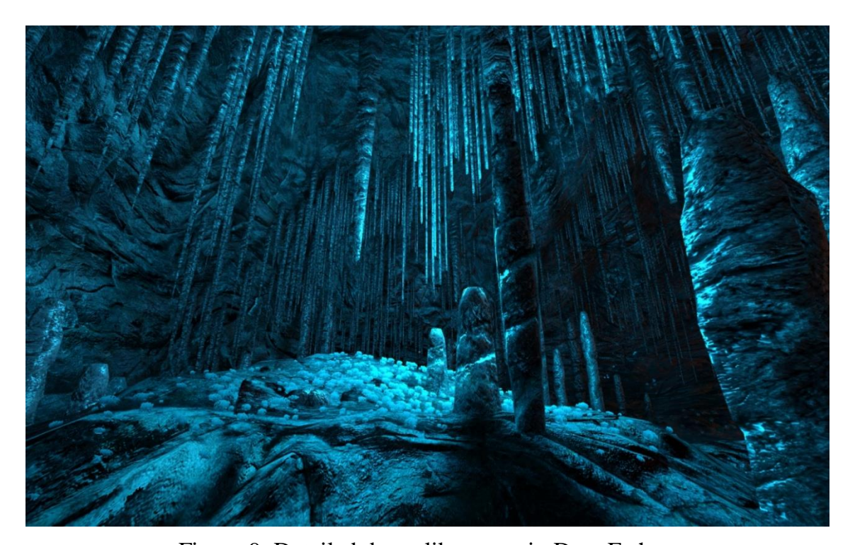
Figure 9: Detailed dreamlike caves in Dear Esther.

does not encounter—or notice- the prenatal ultrasound images, they may never realise that Esther was pregnant and the narrator was to be a parent making his grief worse and making more sense to the player.