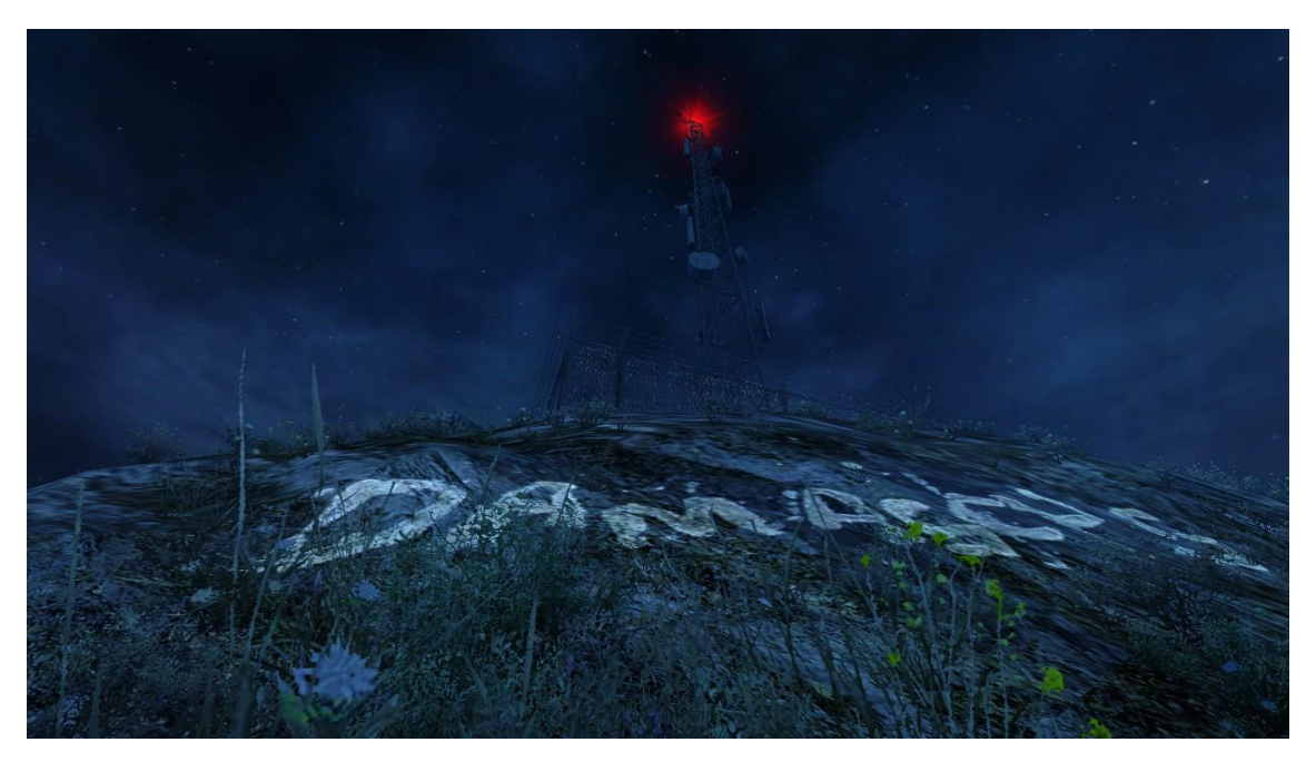
Figure 6: Damascus and other bible references written in fluorescent paint on the island.

This would also suggest that the name Paul of the game is a reference to Paul the Apostle.