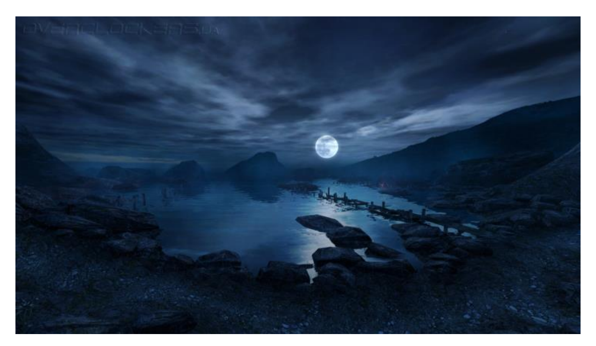
Figure 8: The moonlit island creates an unparalleled atmosphere.

Traditionally, an author would spend a fair amount of time to describe a creature he out fashioned in his novel. The real image of that creature would always be inside the author's imagination and unless he relies on the readers' imagination to picture it, his creative creation would never be seen the way it is meant to be.