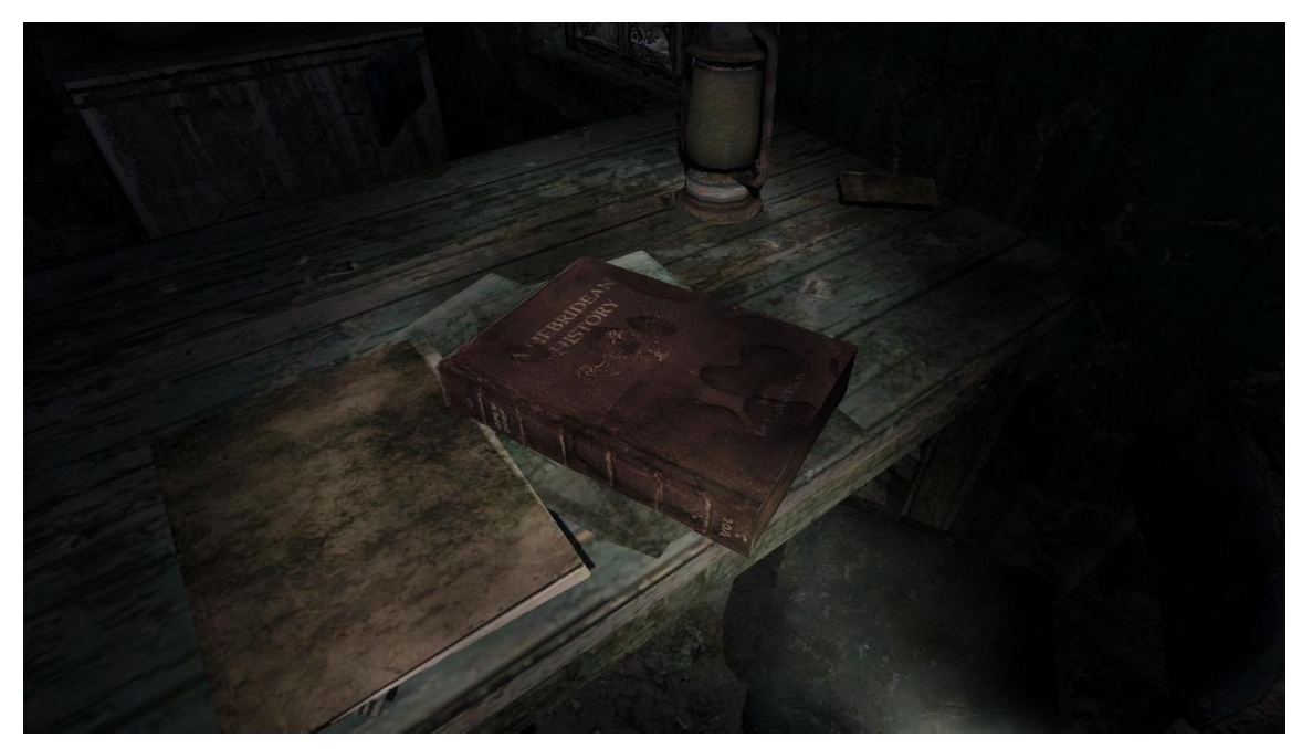
Figure 5 Donnelly's Book, A Hebridean History

The book written by Donnelly can be found on a table in an abandoned house as well as scattered at the entry of a cave but due to his hallucinations or madness, the story and its author had blurred in his mind making the truth indiscernible.